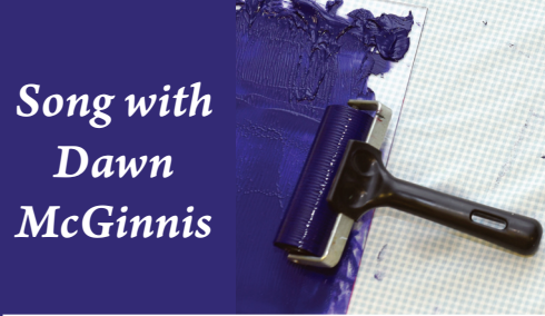
Song with Dawn McGinnis