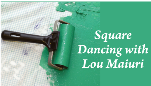
Square Dancing with Lou Maiuri