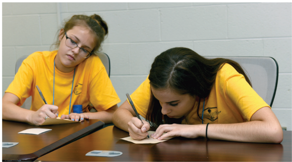
Ambassadors learn the art to writing Thank You Notes!