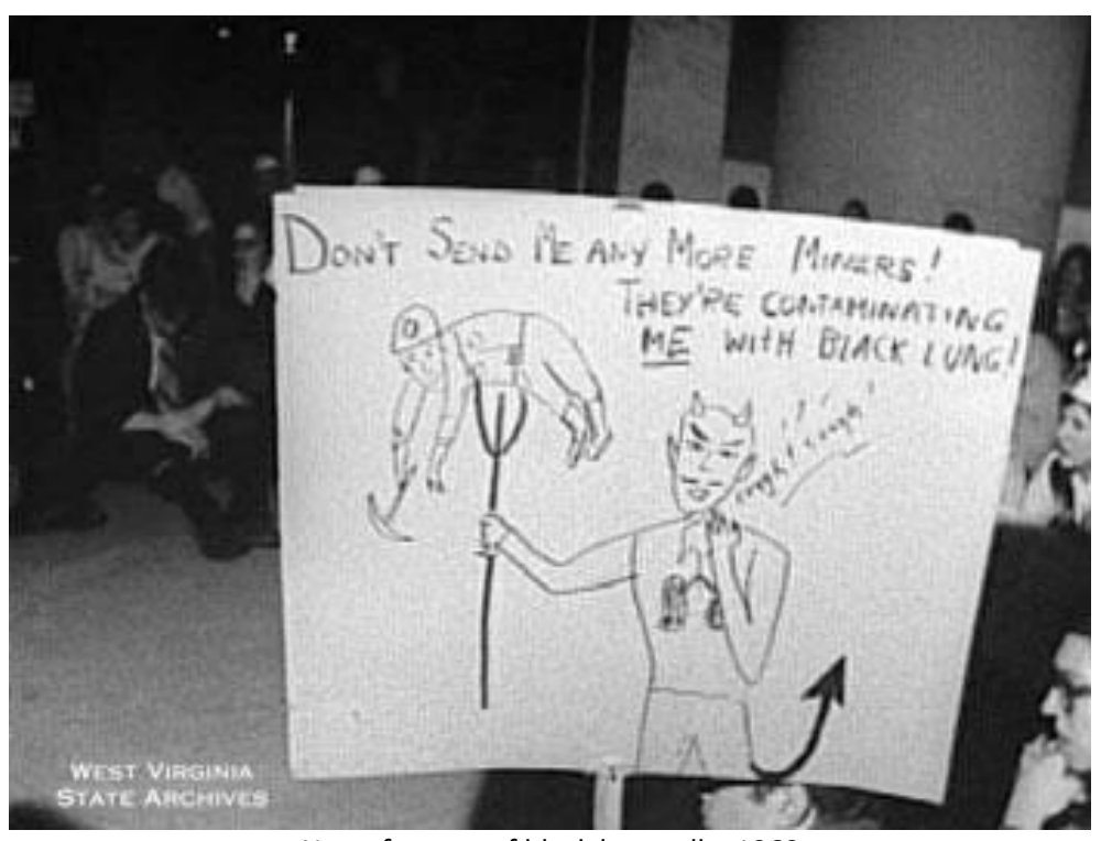
News footage of black lung rally, 1969

On February 18, 1969, UMW coal miners went on strike to protest the absence of black lung benefits.