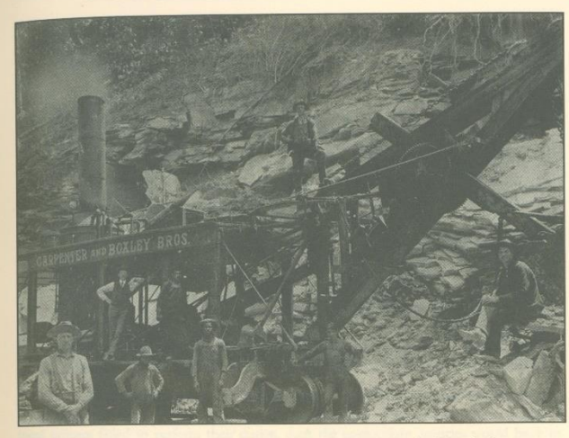
Carpenter and Boxley Brothers steam shovel and construction crew near Kayford, Kanawha County, circa 1905.