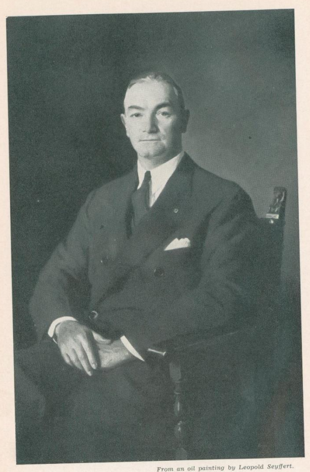
HOMER ADAMS HOLT

Twentieth Governor of West Virginia January 18, 1937 to January 13, 1941