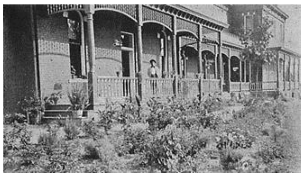
Agricultural Experiment Station at WVU, ca. 1895

Labor leader Walter Reuther was born in Wheeling on September 1, 1907.