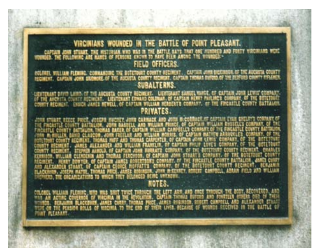
Plaque at the base [opposite side] commemorating the wounded.

My daughter Sheri LaWall with grand-daughter Paige.