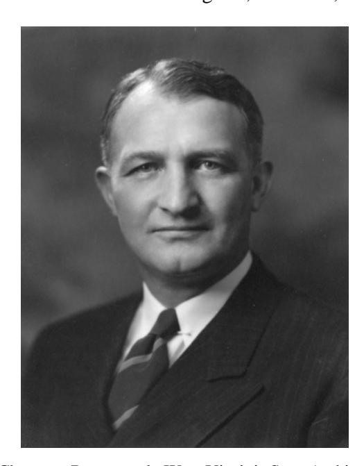
Chapman Revercomb.

licans winning the office of attorney general, seats on the Supreme Court of Appeals, and additional seats in the House of Delegates; however, since