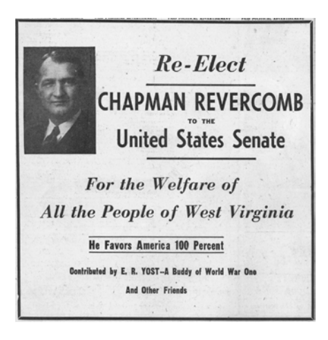
Revercomb political advertisement from the 1948 campaign.

mobilized after largely sitting out the 1946 election. These factors contributed to a huge Democratic year with Truman maintaining the presidency in a shocking defeat of Thomas Dewey and the Democrats reclaiming both houses of Congress. Neely defeated Revercomb decisively by more than one hundred thousand votes and taking thirty-nine counties. <sup>17</sup>