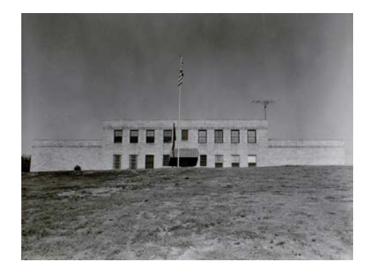
Original academy structure, A Building, immediately after construction in 1949; designated Charles W. Ray Building in 1977

Construction begins with a pair of borrowed bulldozers, 1948; the only person identified in this photo is Sgt. Ralph D. Trumbo (center).