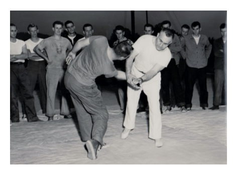
Unarmed combat (jiu-jitsu) instruction

The conservation commission and the liquor control commission again used academy facilities to train their enforcement personnel. The DPS accommodated by supplying instructors.<sup>18</sup>