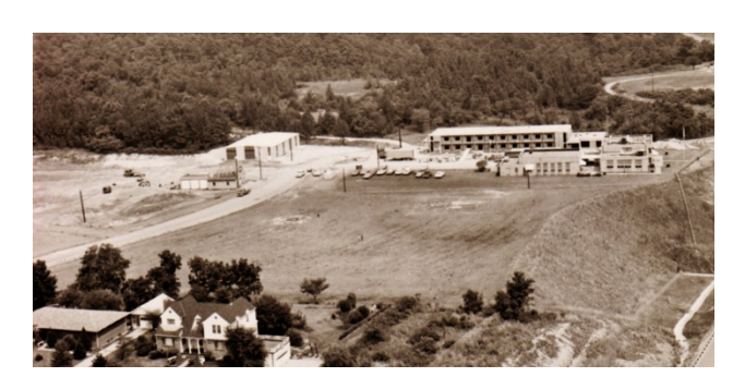
Dormitory building under construction, circa 1969

of the most modern dormitory facilities of police academies in the country. It is a well-built, extremely serviceable type of building; built specifically to suit our needs and designed according to our request. It has proved to be very satisfactory."<sup>31</sup>