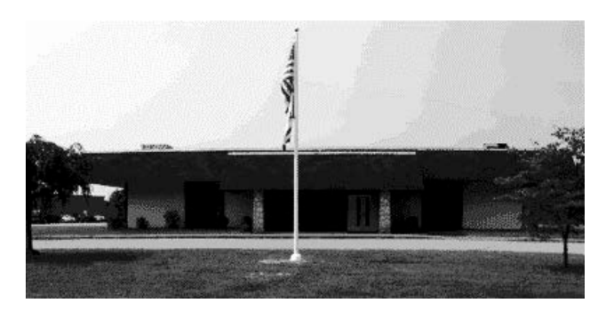
Professional Development Center classroom building; formerly the Shawnee Hills Regional Center

Between July 1974 and May 2002, the Shawnee Hills Regional Center operated on a 32-acre tract of land adjacent to the academy's eastern boundary. The facility provided services to mentally challenged and handicapped children and adults. When the center went bankrupt, the department offered to purchase 32 acres and existing buildings for $1.05 million. But the Kanawha County commissioners immediately insisted that they should receive $660,000 of the sale price. Their claim was based on the fact that they had donated the land in 1968 on condition that it be used to help the mentally ill. If it were used for any other use, the land would revert to county control. The department stated that it needed