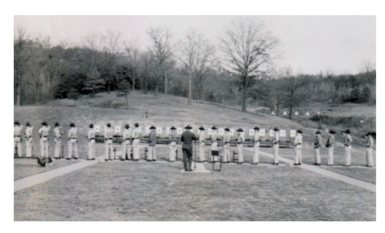
Below: Range time