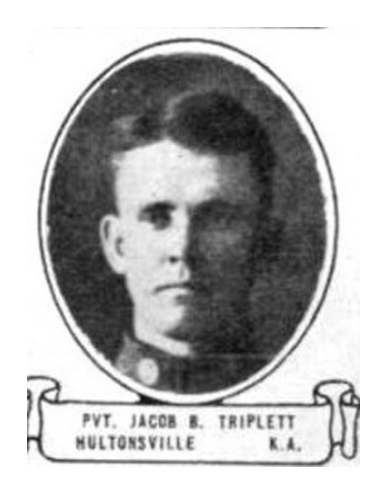
Soldiers of the Great War, Vol. III

listed in Volume III. but Volume I includes a detailed timeline of events from 1914 through 1918. The Memorial Edition includes supplement listing casualties not included in previous editions.<sup>18</sup>