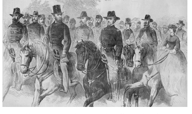
The President, General Hooker, and Their Staff at a review of the Army of the Potomac.