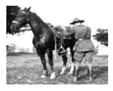
Horses being "trained to fire;" shielding their rider was often essential to the trooper's survival in combat.

Picked riders from the force throughout the state will be located there to 'break' the new ones."