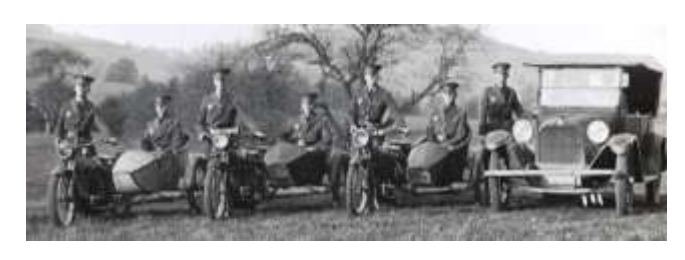
"Motorization" portended the demise of horse-mounted patrols and eventual closure of the Haywood Junction camp itself.

The writer also opined that "Clarksburg is the junction point of four main arteries of travel and the ideal location for the new motorized department of public safety." A few weeks later, Colonel Shingleton visited Haywood Junction for several